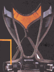
Deck Pro Harness

This may become known as the 'democracy edition' of Seahorse : first the web-driven Flying Tiger (page 45), now the Onyx 28, which has been created by and initially for a small and knowledgeable group of Swiss sailors