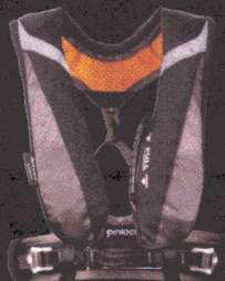
Deck Pro with Lifejacket