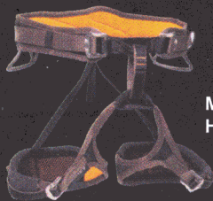
Mast Pro Harness